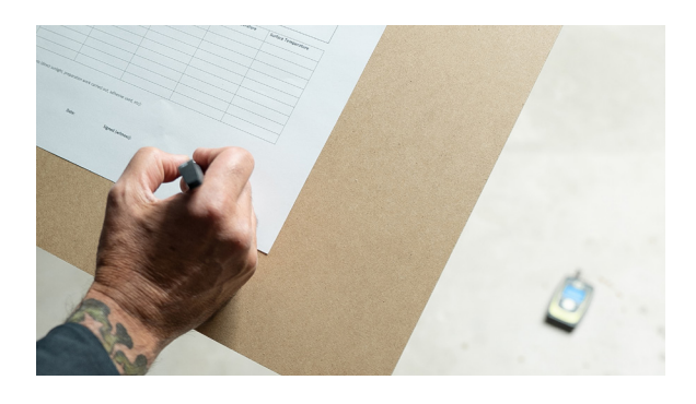
National regulations & standards

Knowledge of the composition and construction of the subfloor or base provides valuable information that allows you to correctly check the acceptable humidity, flatness, compressive and tensile strength of the subfloor. In addition, it tells you what type of floor preparation, levelling/ smoothing compound, and possible moisture barrier you may need during the installation process. When there is ambiguity or doubt about the quality or composition of your subfloor, check your local installation standards and/or seek advice from your floor preparation, levelling compound manufacturer/supplier.